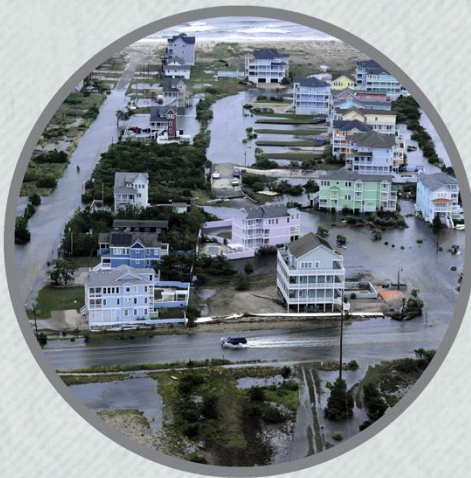
Climate Change Mitigation and Adaptation