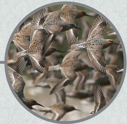
Sustainable Communities and Ecosystems